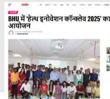
आयोजन में शामिल हुए अखिल और राष्ट्रीय कोशिस में भाग लेने वाले प्रतिनिधियों आयोजन में शामिल हुए अखिल और राष्ट्रीय कोशिस में भाग लेने वाले प्रतिनिधियों आयोजन में शामिल हुए अखिल और राष्ट्रीय कोशिस में भाग लेने वाले प्रतिनिधियों