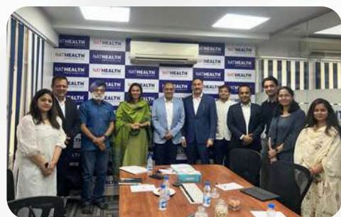
Providers Forum Meeting

To identify focus areas for NATHEALTH's upcoming initiatives.