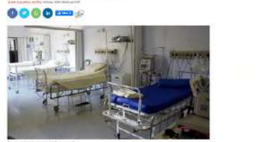
NEW DELHI: A group of India's top private hospitals, including corporate ones, are pushing for changes in the National Building Code (NBC) with an eye to allow raising the height of existing buildings to accommodate tens of thousands of additional beds. The plan has been...

Leaders in Coimbatore, Maharashtra, led a consortium of private players, while 100 patients remained in the hospital, which is 45 m to 60 m for adding additional 3-4 floors.