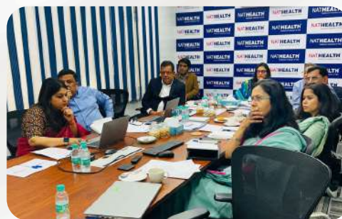
Leadership Team Meeting

To align on key priority areas for the year.