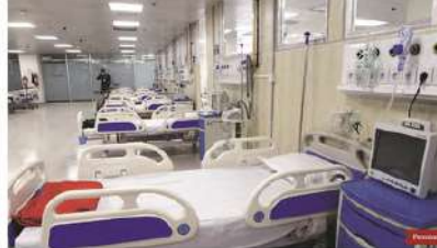
INDIA'S HEALTHCARE SYSTEM REMAINS ANTAGONIC, REPORTING ORGANISATIONS BELIEVE. STRONGER PPPs CAN DRIVE GREATER PRODUCTIVITY AND BETTER PATIENT OUTCOMES.

NATHEALTH also underscored the potential of digital health to increase efficiency and improve healthcare delivery.