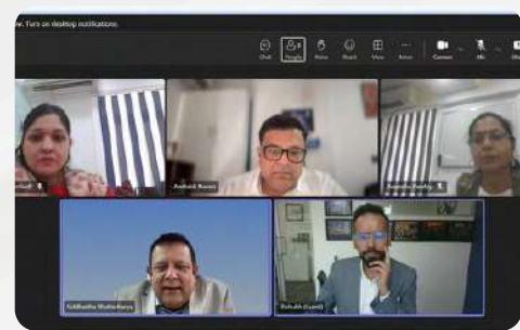
Treasurer's Review Meeting

To assess the current financial status and discuss the plan ahead.