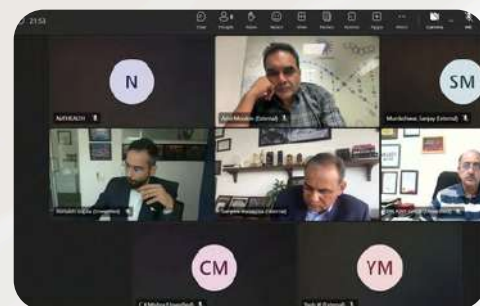
Diagnostic Forum Meeting

To chart out the annual roadmap and planned initiatives.