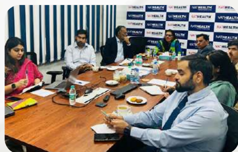
Diagnostic Forum Meeting

To understand current challenges faced by providers and explore potential solutions.